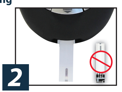
Remove Test Strip from vial and close vial immediately. Insert Test Strip into Test Port with Contact End (blocks facing up). The Meter turns on.

With Test Strip still in Meter, touch Sample Tip to top of blood drop and allow blood to be drawn into Test Strip. Remove from blood drop immediately after Meter beeps and dashes appear across Meter Display.